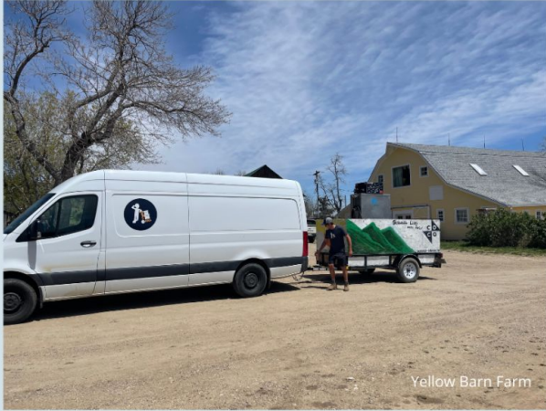
Yellow Barn Farm