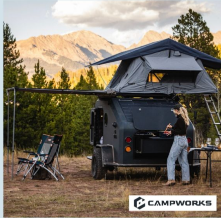
Campworks NS-1 Biocomposites & Mycellium Insulates