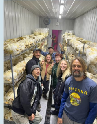
Basking in mycelial growth at MycoLove Farm