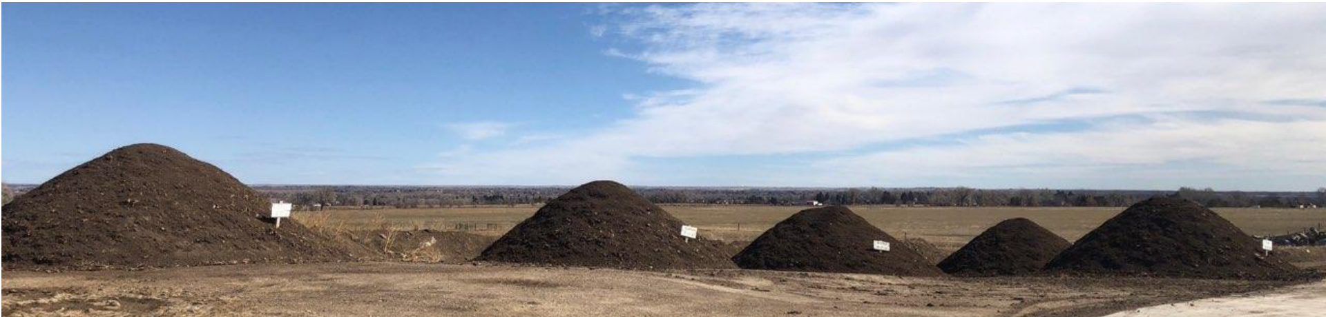
Pictured: Colorado State University compost facility