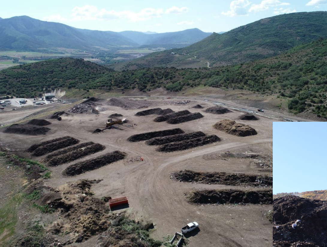
Pitkin County Solid Waste Center Composting Operation