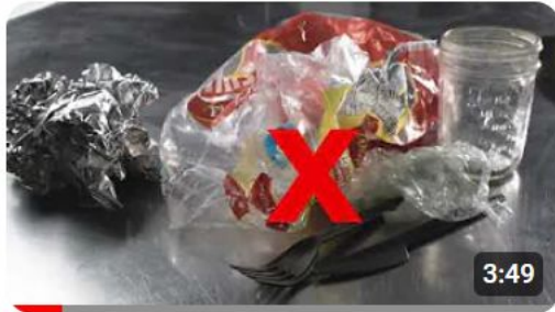
Restaurant Compost Training (SP)