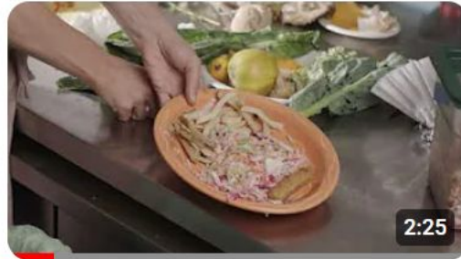
Restaurant Compost Training (ENG)